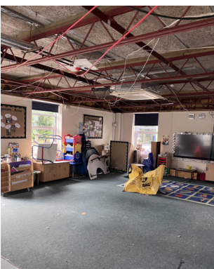
Nursery - after